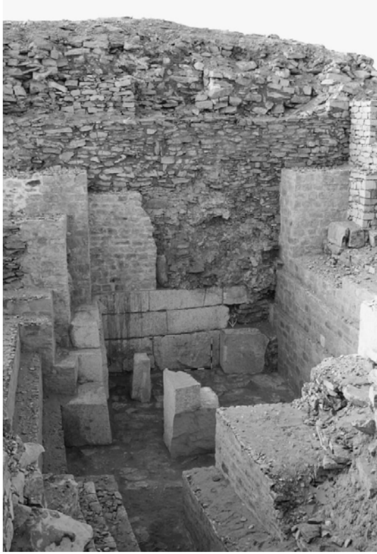
Fig. 2 View of the burial chamber