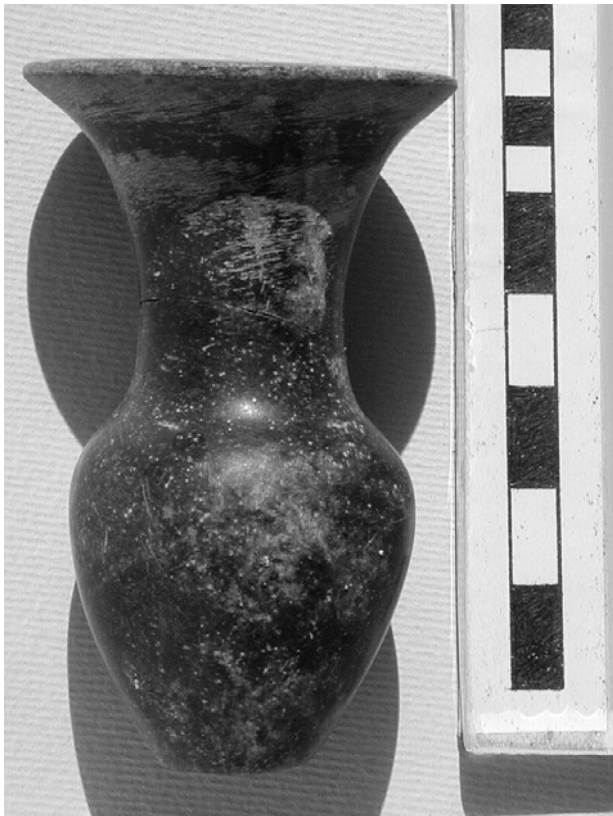
Fig. 4 A model vessel of basalt found in the burial chamber