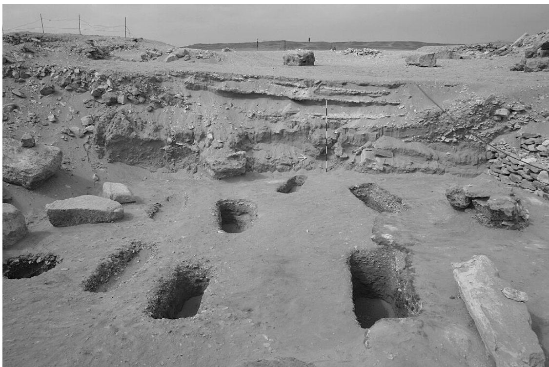
Fig. 5 Secondary burials on the northern site of the pyramid Lepsius No. 25