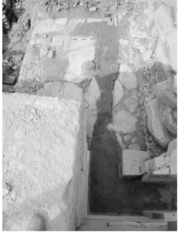
Fig. 3 View of the offering room